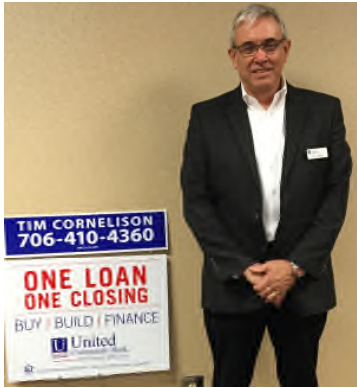
February-United Community Bank

Your involvement with Jackson County Builders Association is very much appreciated!! 2017 Membership Meeting Sponsors!! Thank you!!