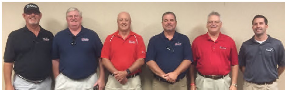
August-Harbin Lumber Company