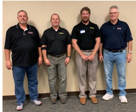
August-Harbin Lumber Company