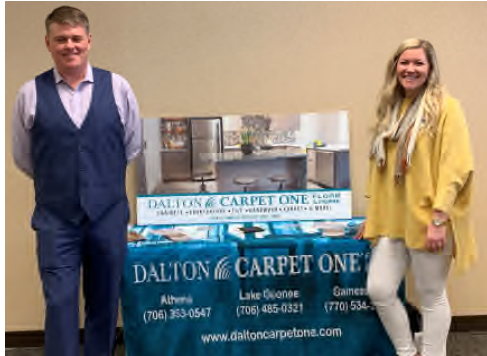
March—Dalton Carpet One

Your involvement with Jackson County Builders Association is very much appreciated!! 2021 Membership Meeting Sponsors!! Thank you!!