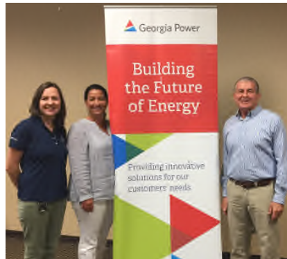
June-Georgia Power Company

Be involved and join us at our membership meetings! Our next membership meeting is August 8th, 12:00 (noon), Jackson EMC Auditorium. Sponsored by Harbin Lumber Company!