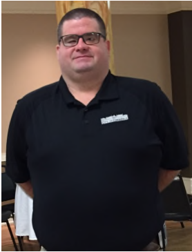
February-City of Commerce Planning & Development Dept.

Your involvement with Jackson County Builders Association is very much appreciated!! Membership Meeting Sponsors!! Thank you!!